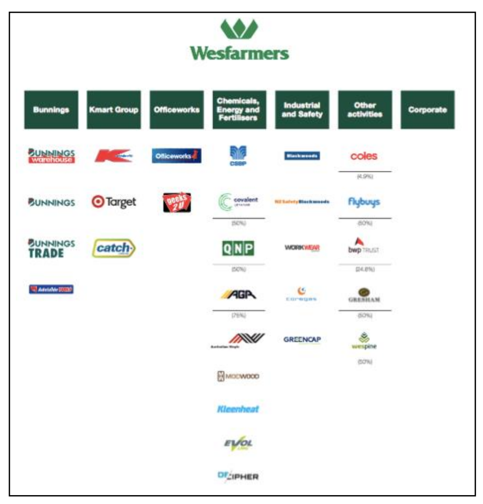
Figure 1. Wesfarmers governance structure.

Wesfarmers has a single Board, with a 'group CEO' for each Strategic Business Unit (SBU).<sup>4</sup> Each group CEO chairs an executive management committee (which is 'board-like' in its function). Each SBU has its own CEO, CFO and COO. This structure, with clear delineation of roles, is the key to its success. The group CEO does not function as a CEO of the SBU, but as the management chair of the SBU. This allows direct and flat management, and bilateral communication, transparency and accountability. The group CEO has their own 'C suite', which are the chief management officers of Wesfarmers.